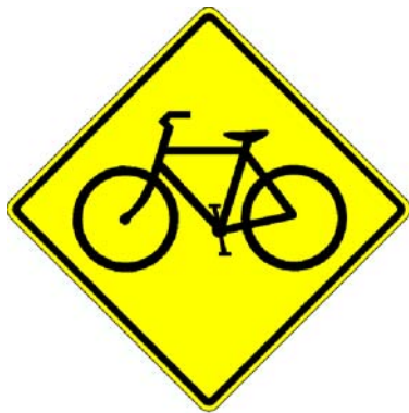
MUTCD W11-1 Sign