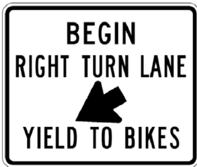
MUTCD R4-4 Sign