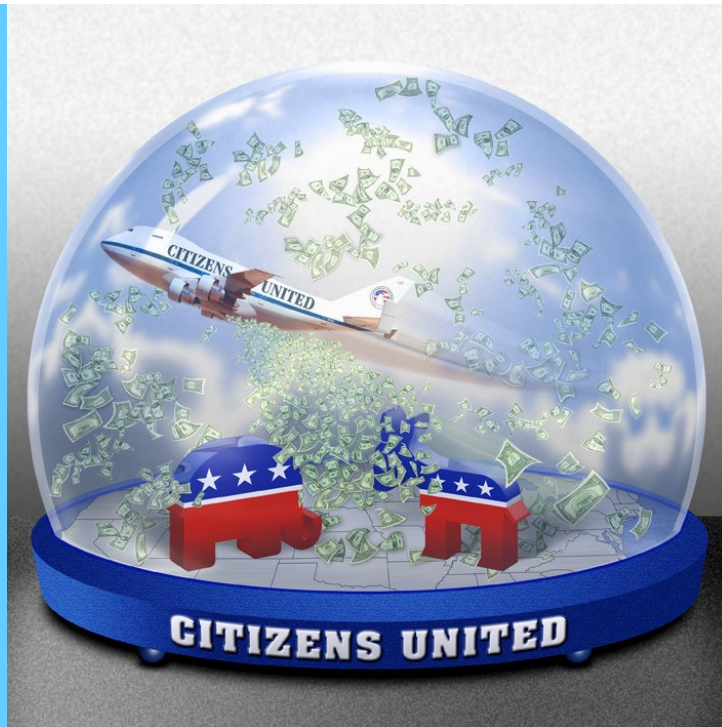
Image: Donkey Hotey, Citizens United Money Globe, Jet image source from Nasa.